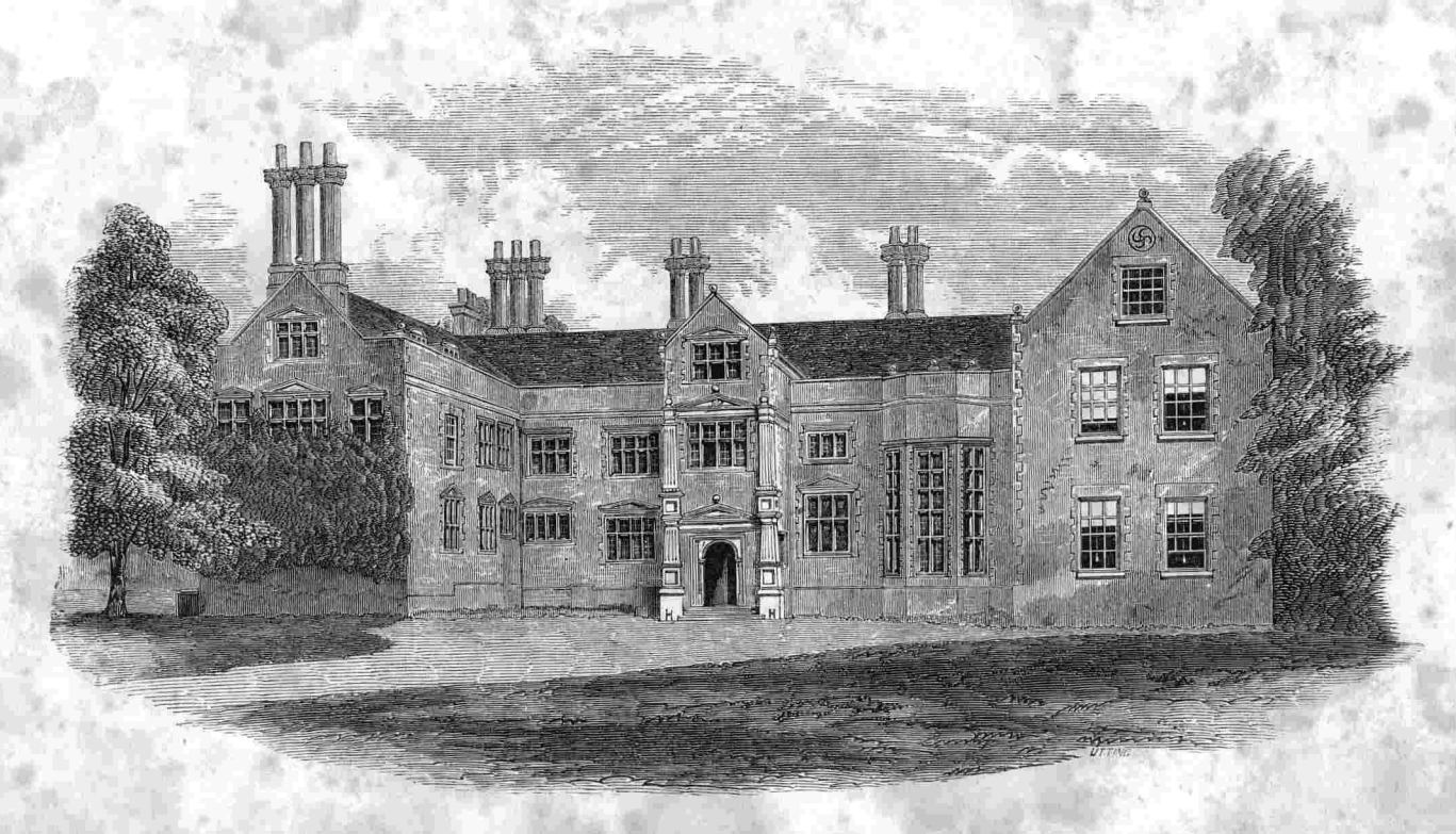
COLDHAM HALL,-PRINCIPAL FRONT,