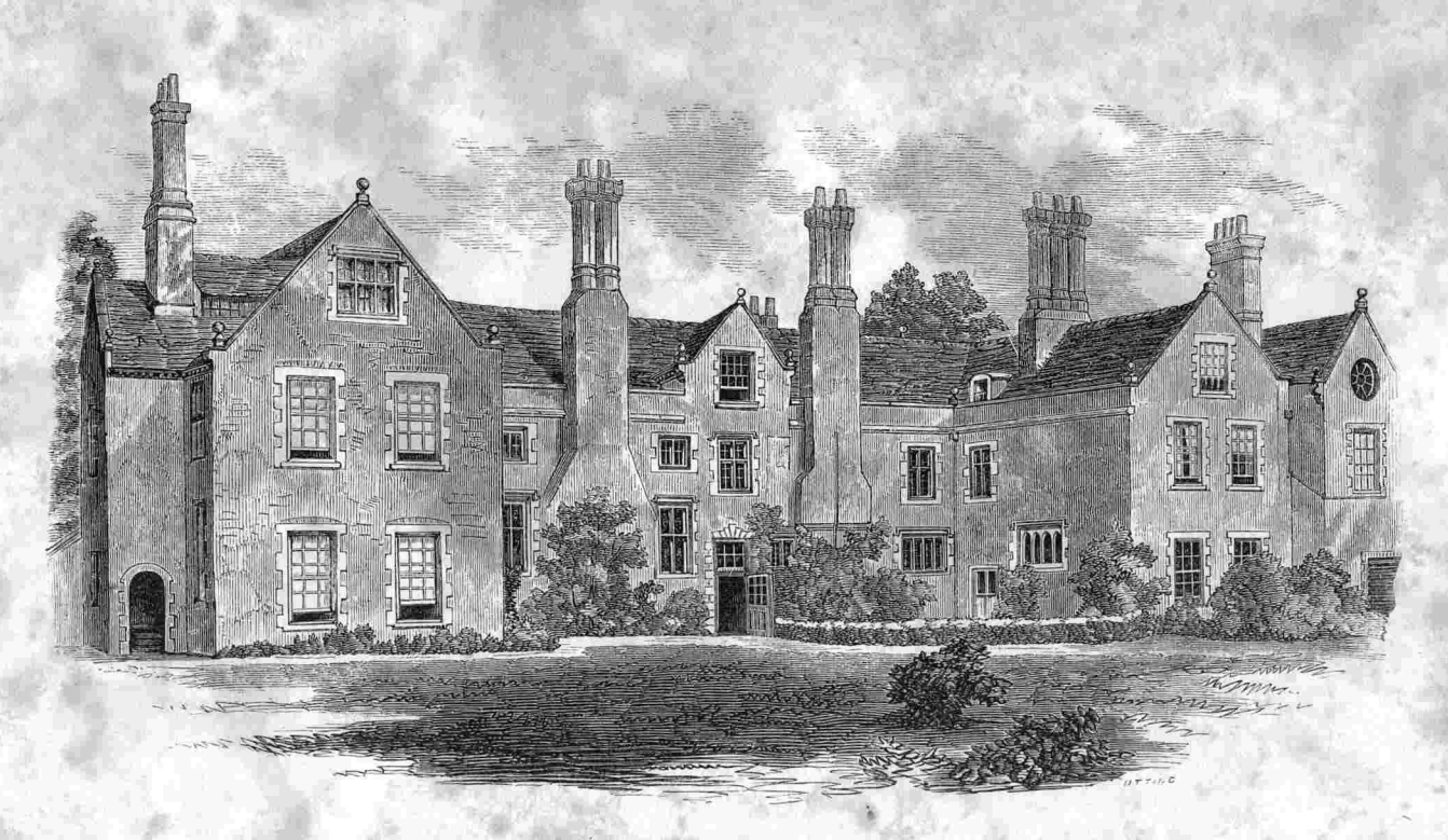
COLDHAM HALL .- GARDEN FRONT.